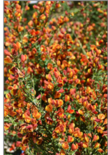
Lena Scotch Broom flowers