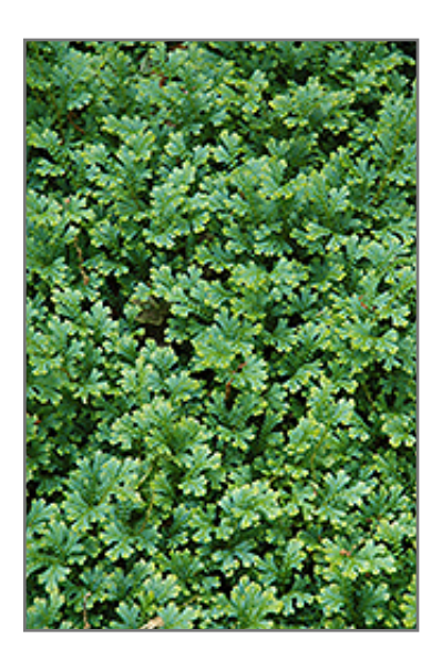
Peacock Spikemoss

This is a relatively low maintenance plant, and should not require much pruning, except when necessary, such as to remove dieback. It has no significant negative characteristics.