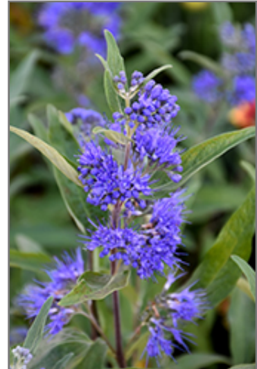
Sapphire Surf Caryopteris flowers

Sapphire Surf Caryopteris is recommended for the following landscape applications;