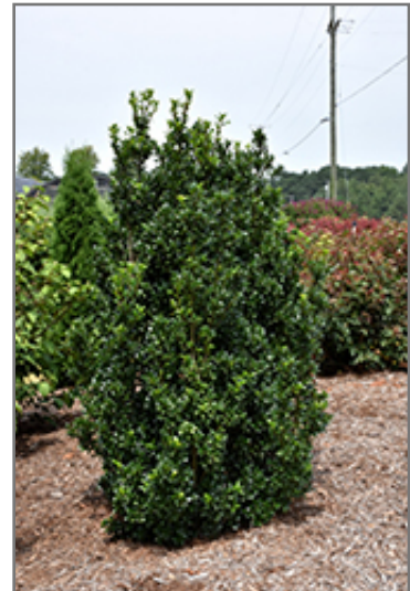
Castle Wall Meserve Holly

Castle Wall Meserve Holly is recommended for the following landscape applications;