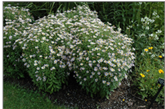
Blue Star Japanese Aster in bloom