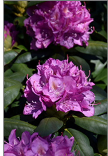
Roseum Elegans Rhododendron flowers