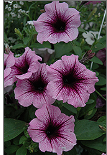
Supertunia Bordeaux Petunia flowers

Supertunia Bordeaux Petunia is recommended for the following landscape applications;