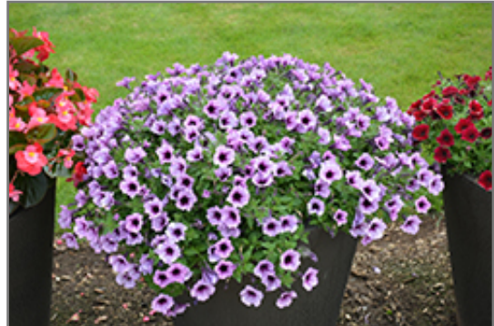
Supertunia Bordeaux Petunia in bloom

Supertunia Bordeaux Petunia will grow to be about 10 inches tall at maturity, with a spread of 24 inches. When grown in masses or used as a bedding plant, individual plants should be spaced approximately 20 inches apart. Its foliage tends to remain low and dense right to the ground. This fast-growing annual will normally live for one full growing season, needing replacement the following year.