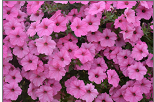
Supertunia Vista Bubblegum Petunia flowers

Supertunia Vista Bubblegum Petunia is recommended for the following landscape applications;