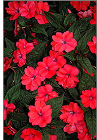
SunPatiens Compact Deep Rose New Guinea Impatiens flowers

SunPatiens Compact Deep Rose New Guinea Impatiens is a dense herbaceous annual with a mounded form. Its medium texture blends into the garden, but can always be balanced by a couple of finer or coarser plants for an effective composition.