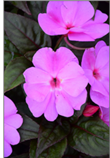
Divine Lavender New Guinea Impatiens flowers

Divine Lavender New Guinea Impatiens is recommended for the following landscape applications;