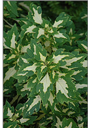
ColorBlaze Alligator Tears Coleus foliage