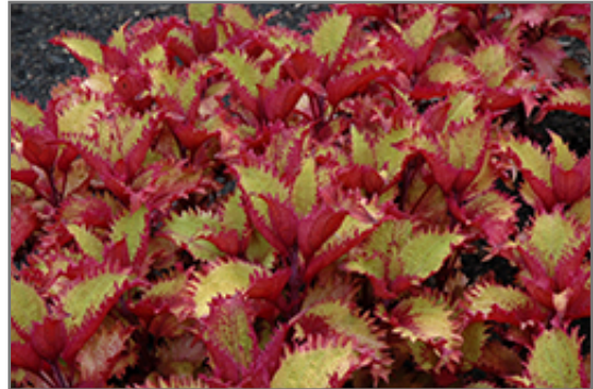
Henna Coleus foliage