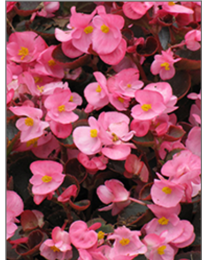
Bada Boom Pink Begonia flowers

This is a high maintenance plant that will require regular care and upkeep, and usually looks its best without pruning, although it will tolerate pruning. Deer don't particularly care for this plant and will usually leave it alone in favor of tastier treats. Gardeners should be aware of the following characteristic(s) that may warrant special consideration;