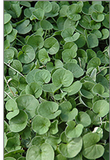
Emerald Falls Dichondra foliage