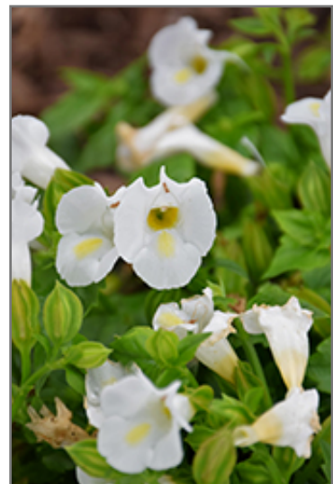
Catalina White Linen Torenia flowers