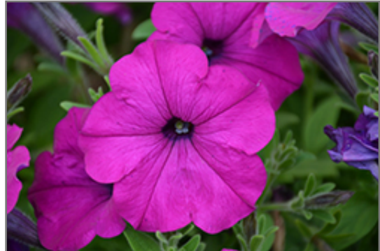
Easy Wave Violet Petunia flowers

Easy Wave Violet Petunia is a dense herbaceous annual with a trailing habit of growth, eventually spilling over the edges of hanging baskets and containers. Its medium texture blends into the garden, but can always be balanced by a couple of finer or coarser plants for an effective composition.