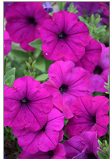
Easy Wave Violet Petunia flowers