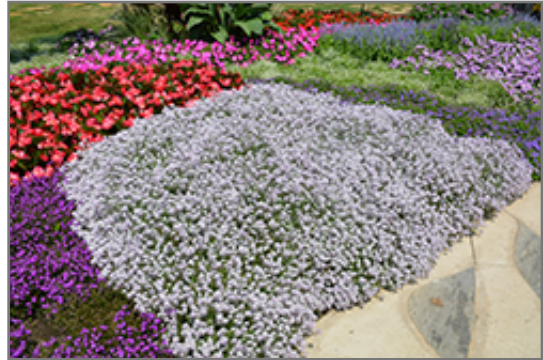
Blushing Princess Sweet Alyssum in bloom

Blushing Princess Sweet Alyssum is a fine choice for the garden, but it is also a good selection for planting in hanging baskets. Because of its trailing habit of growth, it is ideally suited for use as a 'spiller' in the 'spiller-thriller-filler' container combination; plant it near the edges where it can spill gracefully over the pot. Note that when growing plants in outdoor containers and baskets, they may require more frequent waterings than they would in the yard or garden.