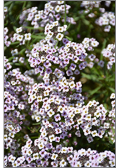
Blushing Princess Sweet Alyssum flowers

This plant will require occasional maintenance and upkeep, and should not require much pruning, except when necessary, such as to remove dieback. It is a good choice for attracting bees and butterflies to your yard, but is not particularly attractive to deer who tend to leave it alone in favor of tastier treats. It has no significant negative characteristics.