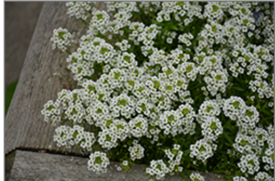
Snow Princess Alyssum flowers

Snow Princess Alyssum is recommended for the following landscape applications;