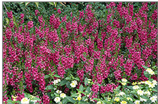
Archangel Dark Rose Angelonia in bloom