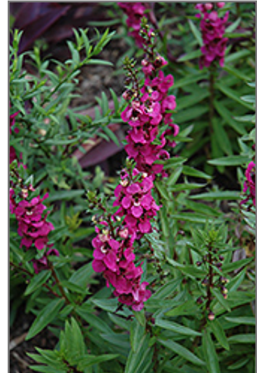
Serenita Raspberry Angelonia flowers

This plant will require occasional maintenance and upkeep, and should not require much pruning, except when necessary, such as to remove dieback. It is a good choice for attracting butterflies to your yard, but is not particularly attractive to deer who tend to leave it alone in favor of tastier treats. It has no significant negative characteristics.