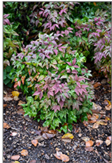
Blush Pink Nandina in fall