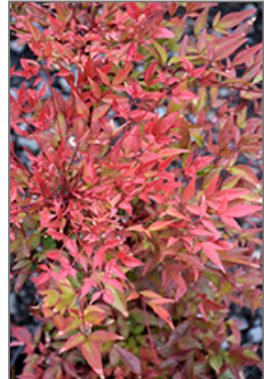
Obsession Nandina foliage