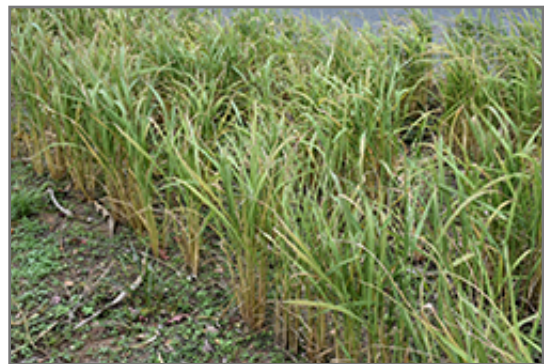
Asian Rice