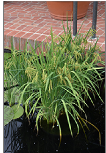
Asian Rice in bloom