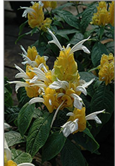
Golden Shrimp Plant flowers

Golden Shrimp Plant is recommended for the following landscape applications;