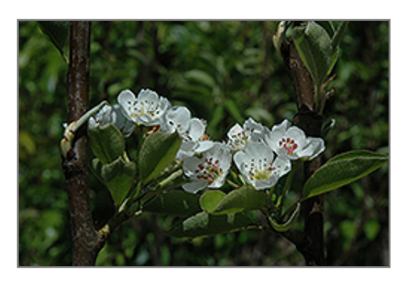
Shinseiki Asian Pear flowers