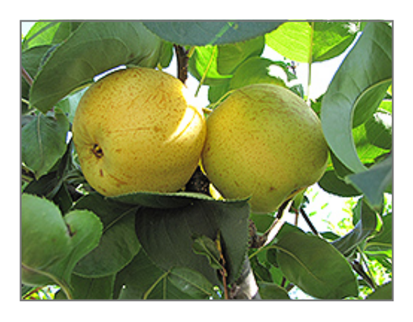
Shinseiki Asian Pear fruit

Shinseiki Asian Pear is clothed in stunning clusters of white flowers with pink anthers along the branches in early spring before the leaves. It has dark green deciduous foliage. The glossy pointy leaves turn an outstanding tomato-orange in the fall. The fruits are showy yellow pears carried in abundance in late summer. The fruit can be messy if allowed to drop on the lawn or walkways, and may require occasional clean-up.