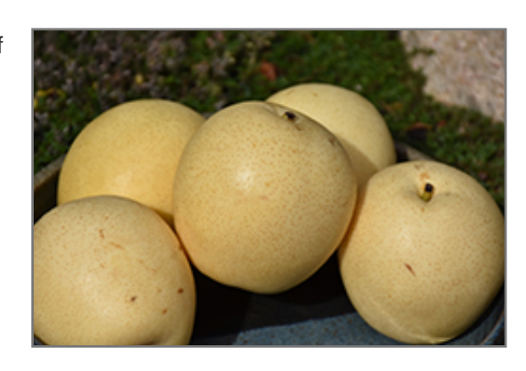
Shinseiki Asian Pear fruit

This tree is typically grown in a designated area of the yard because of its mature size and spread. It should only be grown in full sunlight. It does best in average to evenly moist conditions, but will not tolerate standing water. It is not particular as to soil type or pH. It is highly tolerant of urban pollution and will even thrive in inner city environments. This is a selected variety of a species not originally from North America.