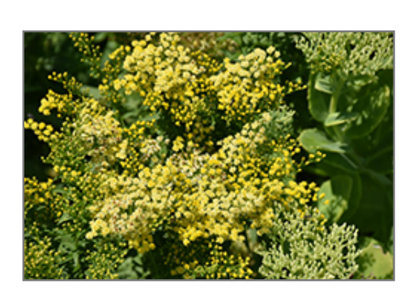
Little Lemon Goldenrod flowers

A very compact form producing a splash of lemon yellow in the garden when little else is blooming; attracts butterflies and looks perfect in containers