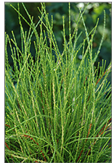
Franky Boy Arborvitae foliage