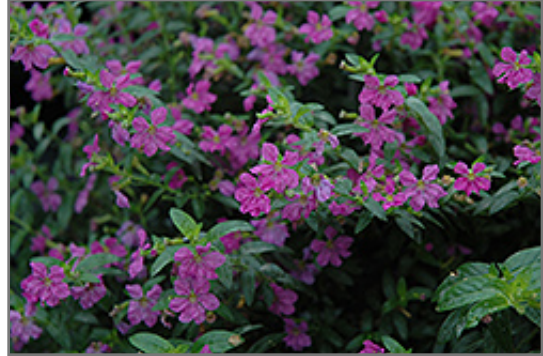
Allyson Mexican Heather flowers