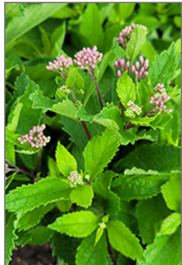
Phantom Joe Pye Weed flower buds