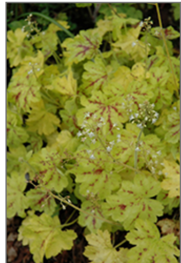
Solar Power Foamy Bells flowers