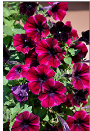
Sweetunia Johnny Flame Petunia flowers