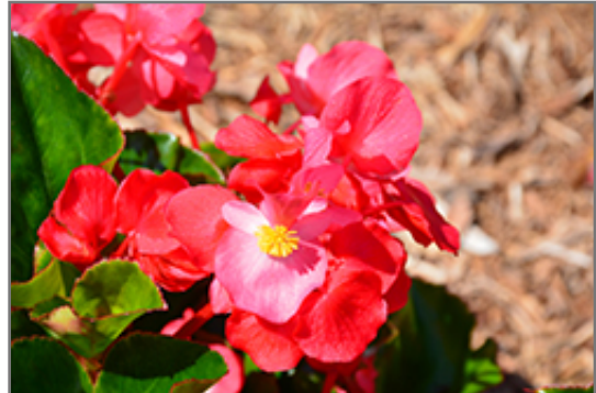
Whopper Rose Green Leaf Begonia flowers

Whopper Rose Green Leaf Begonia is an herbaceous annual with a mounded form. Its medium texture blends into the garden, but can always be balanced by a couple of finer or coarser plants for an effective composition.