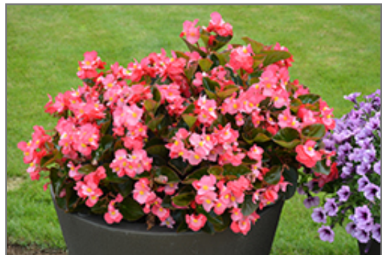
Surefire Rose Begonia in bloom