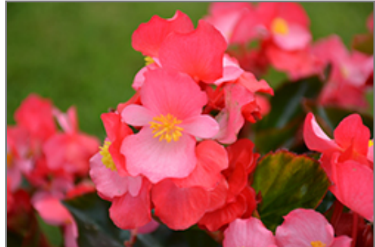
Surefire Rose Begonia flowers

Surefire Rose Begonia is an herbaceous annual with an upright spreading habit of growth. Its medium texture blends into the garden, but can always be balanced by a couple of finer or coarser plants for an effective composition.