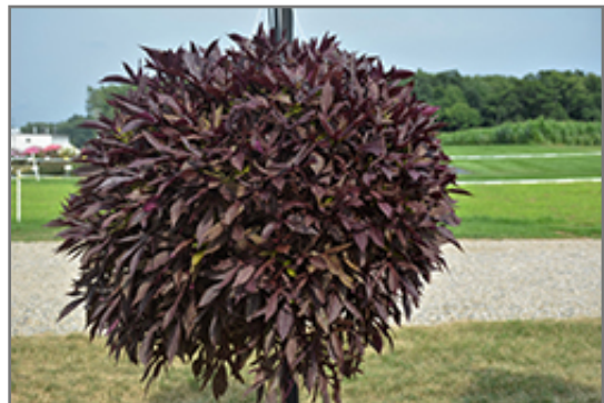
Illusion Garnet Lace Sweet Potato Vine