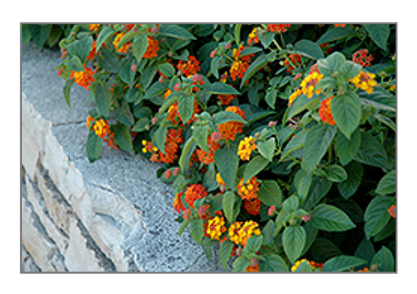
Lucky Red Flame Lantana flowers