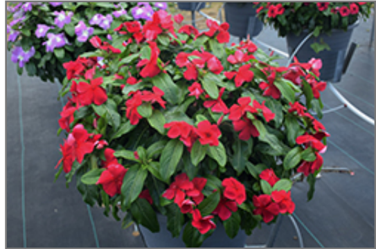
Titan Dark Red Vinca in bloom

Titan Dark Red Vinca is a fine choice for the garden, but it is also a good selection for planting in outdoor containers and hanging baskets. It is often used as a 'filler' in the 'spiller-thriller-filler' container combination, providing a mass of flowers against which the thriller plants stand out. Note that when growing plants in outdoor containers and baskets, they may require more frequent waterings than they would in the yard or garden.