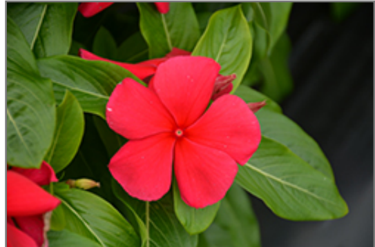
Titan Dark Red Vinca flowers

This plant will require occasional maintenance and upkeep, and should not require much pruning, except when necessary, such as to remove dieback. It is a good choice for attracting butterflies to your yard, but is not particularly attractive to deer who tend to leave it alone in favor of tastier treats. It has no significant negative characteristics.