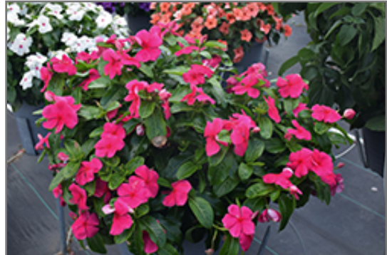
Titan Punch Vinca in bloom

Titan Punch Vinca is a fine choice for the garden, but it is also a good selection for planting in outdoor containers and hanging baskets. It is often used as a 'filler' in the 'spiller-thriller-filler' container combination, providing a mass of flowers against which the thriller plants stand out. Note that when growing plants in outdoor containers and baskets, they may require more frequent waterings than they would in the yard or garden.