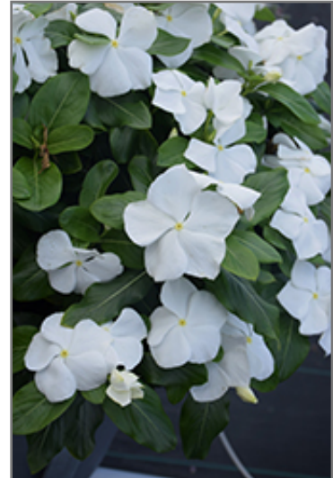
Titan Pure White Vinca flowers

This plant will require occasional maintenance and upkeep, and should not require much pruning, except when necessary, such as to remove dieback. It is a good choice for attracting butterflies to your yard, but is not particularly attractive to deer who tend to leave it alone in favor of tastier treats. It has no significant negative characteristics.