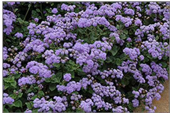
High Tide Blue Flossflower in bloom