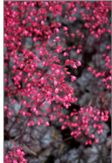
Glitter Coral Bells flowers

Glitter Coral Bells is a fine choice for the garden, but it is also a good selection for planting in outdoor pots and containers. It is often used as a 'filler' in the 'spiller-thriller-filler' container combination, providing a mass of flowers and foliage against which the larger thriller plants stand out. Note that when growing plants in outdoor containers and baskets, they may require more frequent waterings than they would in the yard or garden.