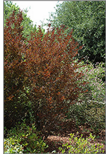
Cherry Dazzle Crapemyrtle

Cherry Dazzle Crapemyrtle makes a fine choice for the outdoor landscape, but it is also well-suited for use in outdoor pots and containers. Because of its height, it is often used as a 'thriller' in the 'spiller-thriller-filler' container combination; plant it near the center of the pot, surrounded by smaller plants and those that spill over the edges. It is even sizeable enough that it can be grown alone in a suitable container. Note that when grown in a container, it may not perform exactly as indicated on the tag - this is to be expected. Also note that when growing plants in outdoor containers and baskets, they may require more frequent waterings than they would in the yard or garden.