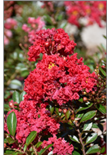
Cherry Dazzle Crapemyrtle flowers

This shrub will require occasional maintenance and upkeep. Trim off the flower heads after they fade and die to encourage more blooms late into the season. It has no significant negative characteristics.