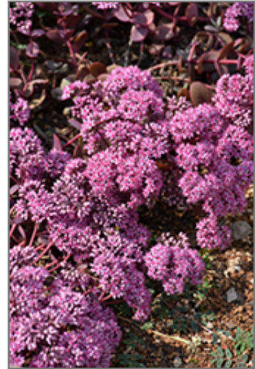
Cherry Tart Stonecrop flowers

Cherry Tart Stonecrop is a fine choice for the garden, but it is also a good selection for planting in outdoor pots and containers. It is often used as a 'filler' in the 'spiller-thriller-filler' container combination, providing a mass of flowers and foliage against which the larger thriller plants stand out. Note that when growing plants in outdoor containers and baskets, they may require more frequent waterings than they would in the yard or garden.