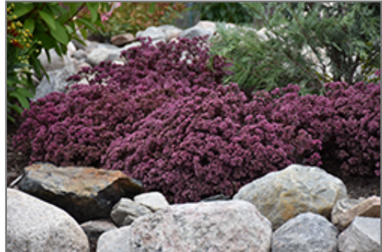
Cherry Tart Stonecrop in bloom

Cherry Tart Stonecrop is a dense herbaceous perennial with an upright spreading habit of growth. Its medium texture blends into the garden, but can always be balanced by a couple of finer or coarser plants for an effective composition.