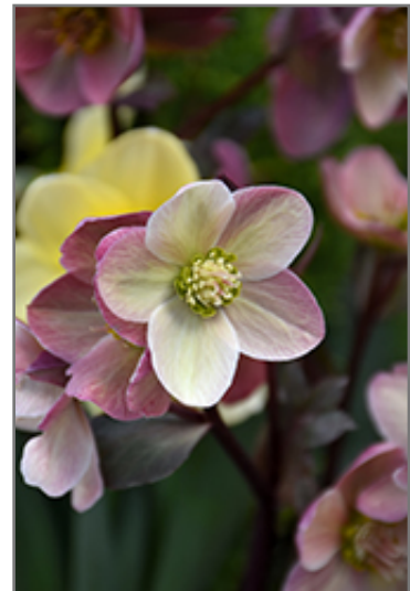
Pink Frost Hellebore flowers