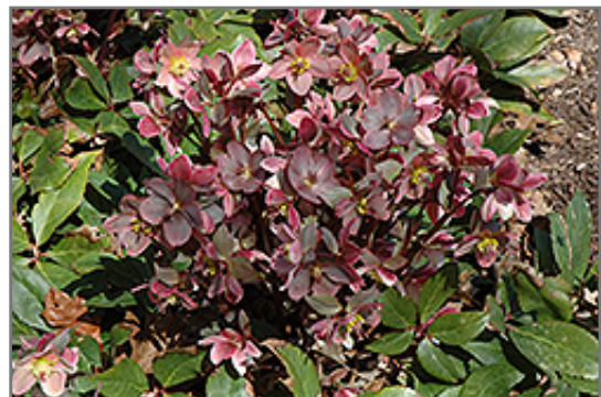
Pink Frost Hellebore in bloom