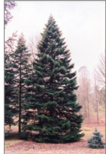
Nordmann Fir