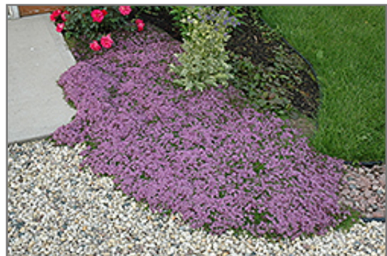
Red Creeping Thyme in bloom