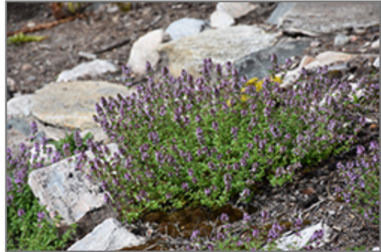
Lemon Thyme in bloom

This plant is quite ornamental as well as edible, and is as much at home in a landscape or flower garden as it is in a designated herb garden. It should only be grown in full sunlight. It prefers to grow in average to dry locations, and dislikes excessive moisture. It is considered to be drought-tolerant, and thus makes an ideal choice for a low-water garden or xeriscape application. It is not particular as to soil type or pH. It is highly tolerant of urban pollution and will even thrive in inner city environments. Consider covering it with a thick layer of mulch in winter to protect it in exposed locations or colder microclimates. This particular variety is an interspecific hybrid. It can be propagated by division; however, as a cultivated variety, be aware that it may be subject to certain restrictions or prohibitions on propagation.