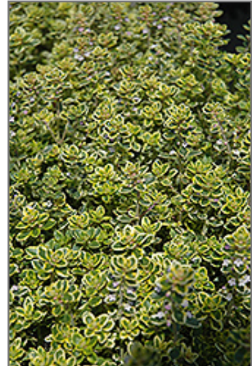
Lemon Thyme foliage

Lemon Thyme is smothered in stunning spikes of lilac purple flowers rising above the foliage from early to late summer. Its attractive tiny fragrant round leaves remain light green in color throughout the year.