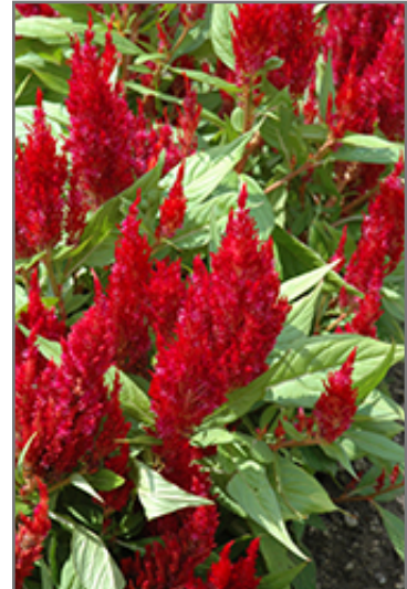
First Flame Red Celosia flowers

First Flame Red Celosia is recommended for the following landscape applications;