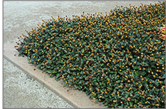
Peek A Boo Para Cress in bloom

Peek A Boo Para Cress is recommended for the following landscape applications;