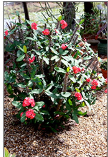
Crown Of Thorns in bloom