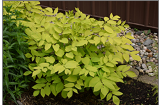
Sun King Japanese Spikenard