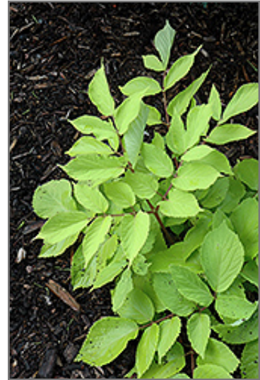
Sun King Japanese Spikenard foliage

This plant performs well in both full sun and full shade. It prefers to grow in average to moist conditions, and shouldn't be allowed to dry out. It is not particular as to soil type or pH. It is highly tolerant of urban pollution and will even thrive in inner city environments. This is a selected variety of a species not originally from North America.